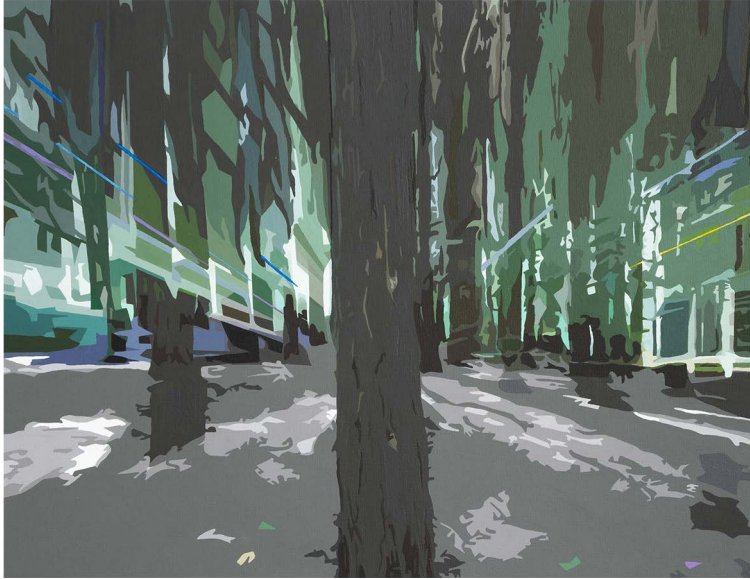
MAGICAL FOREST 31" x 24" Acrylic on Panel

An air of ancient mystery hung in the clearing between the trees. The vibrant earthy tones stood peacefully as they have for centuries; silent but for the preternaturally familiar hum of city creatures living there. Like the forest itself, they continue on forgotten until one takes the time to pause and look for them. For generations, the Magical Forest was left ignored – a civilization of natural order being substituted for roots of silicon and bright shining diodes. We have awakened, and we will continue to. Now that we have mastered the digital realm, we find ourselves still charged with curiosity, fascination, and exploration. Never before, now that we re-engage with the physical world, have the tools been at hand for us to deeply commune with this forest.